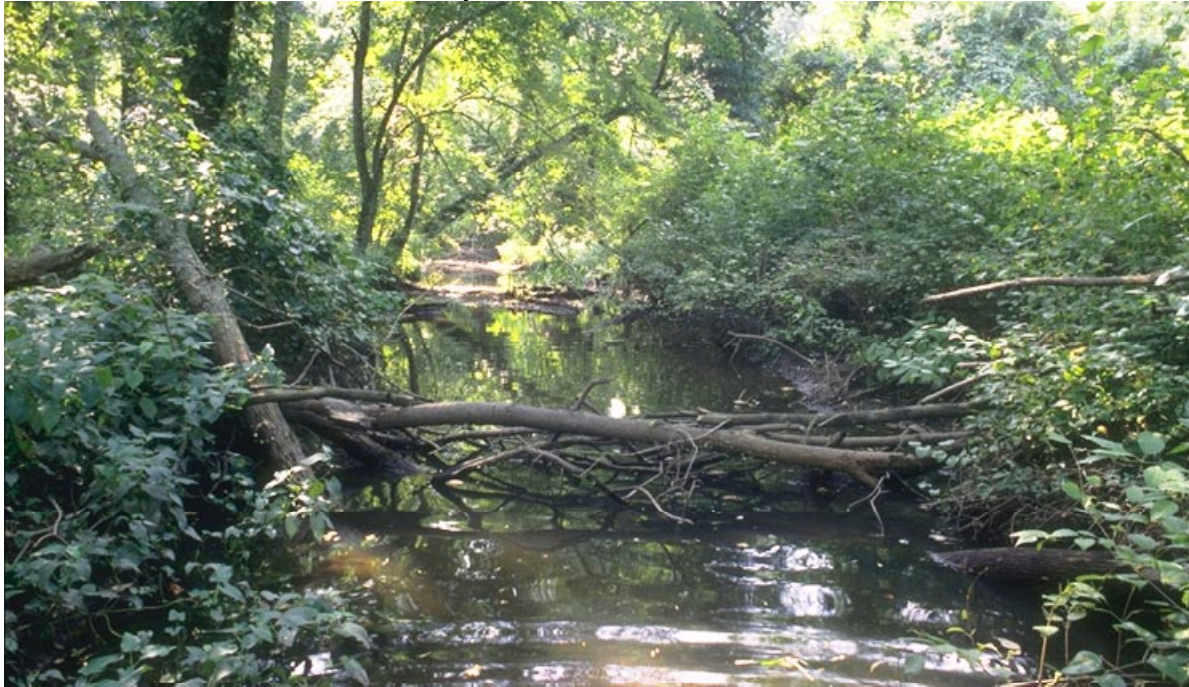
Site 2 - Tappahanna Ditch, Kent County, Delaware