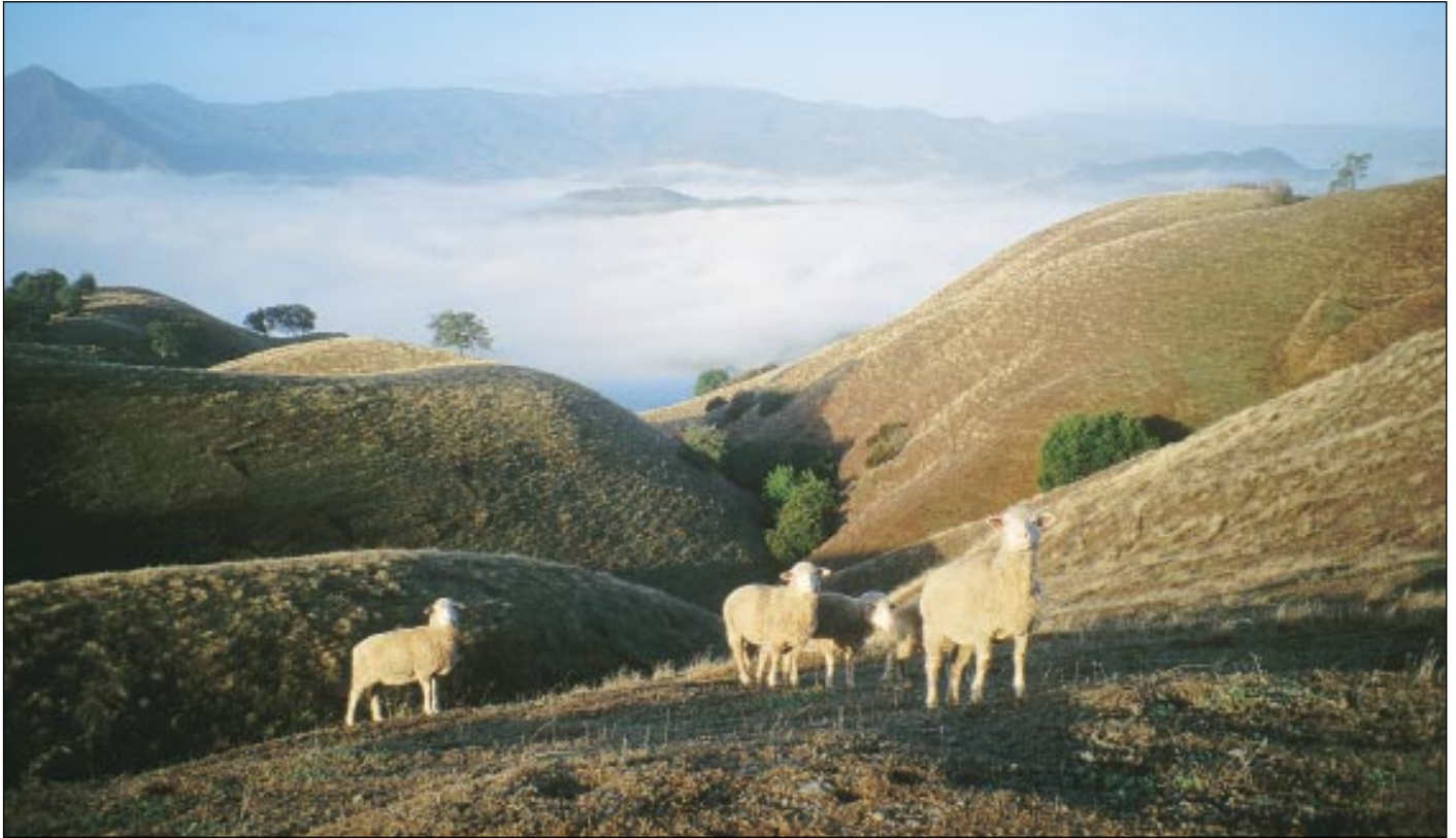
To protect water quality, many ranchers on California's North Coast are required to evaluate and mitigate the potential for delivery of sediment to streams on their property. Sheep graze on an oak woodland slope in the Russian River watershed.