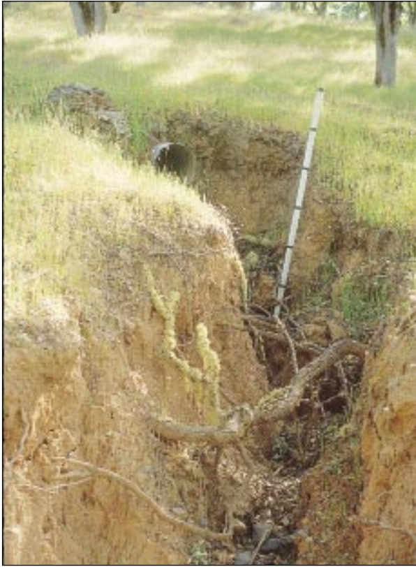
Source site of sediment delivery associated with gully erosion and resulting from road drainage management and culvert design. Current water-quality regulations require inventory, monitoring and mitigation of this site.*

surveyed is attributable to unstable areas, and that current TMDL development and implementation strategies will address no more than 1% of the total deliverable sediment identified. Landowners commented that on unstable areas they had the least capacity to control sediment delivery because of the large site size and the engineering and financial resources required to implement control measures, which can be likened to CalTrans efforts to control mountain slides on the Pacific Coast Highway. Landowners also stated that these sites represent the greatest economic losses in terms of degraded and lost rangelands, and that they generate the greatest concern about regulatory ramifications. Nonetheless, mitigation of unstable areas appears to be critical to attainment of TMDL goals, and will require the cooperative efforts of regulators, landowners and restoration funding agencies.