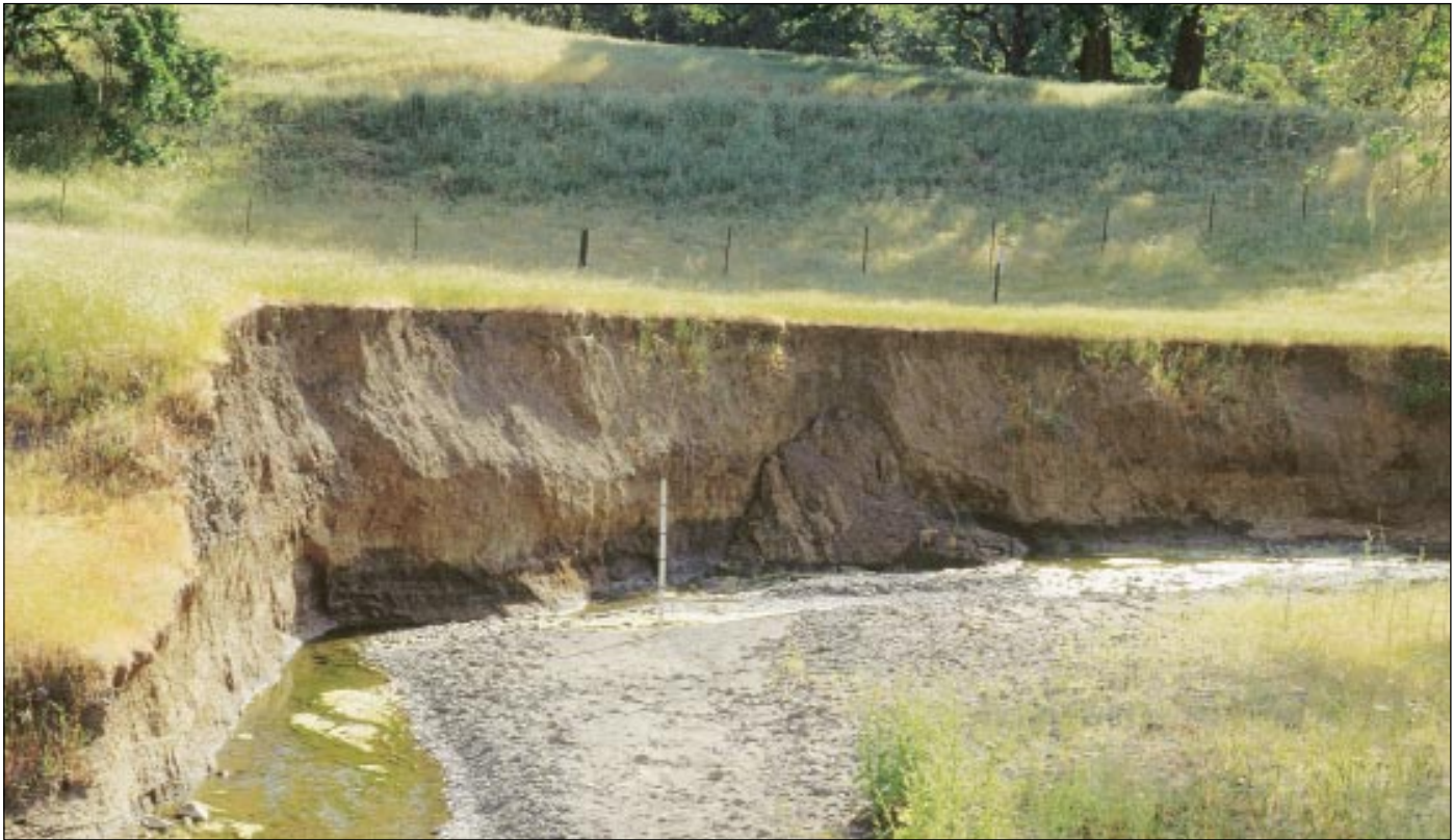
Unstable area of sediment delivery associated with bank-cutting and resulting from historical and natural influences. Current water-quality regulations require inventory and monitoring but not mitigation of this site.*

(160 cubic yards × 60% and 160 cubic yards × 90%).