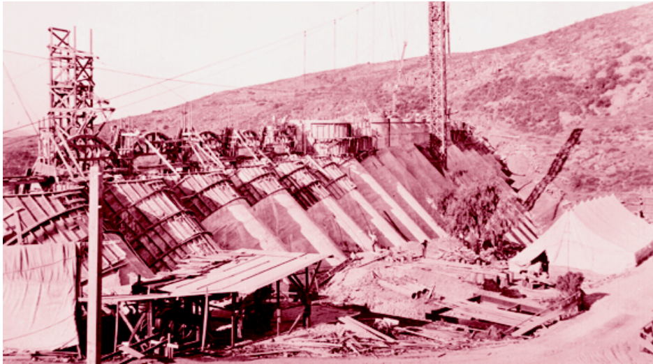
The City of San Diego's Murray Dam, shown under construction in 1917, is a multiple arch concrete dam impounding a 6 taf reservoir. The wooden stave pipeline below conveyed supplies for the Cuyamaca Water Company.