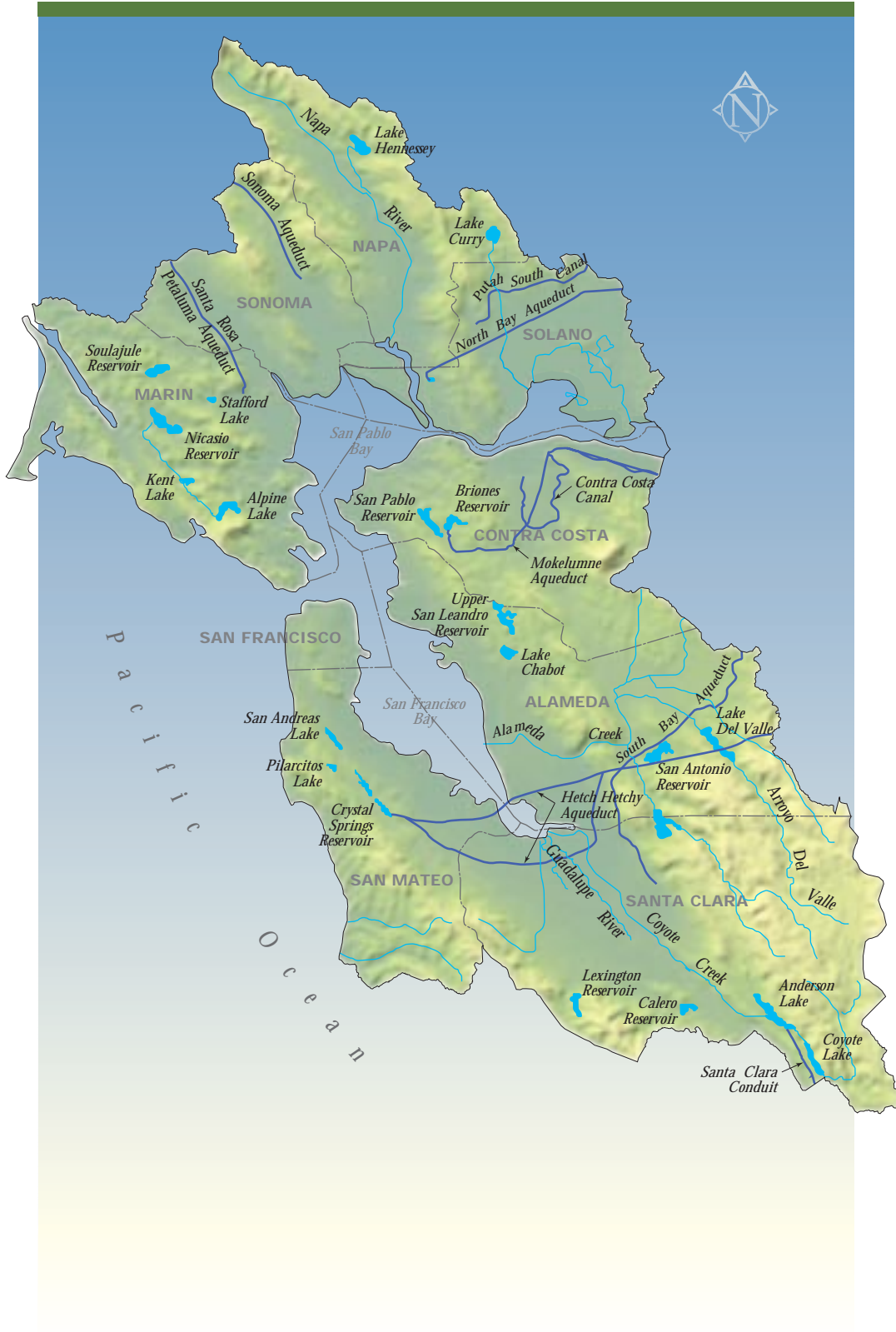
FIGURE 7-3. San Francisco Bay Hydrologic Region