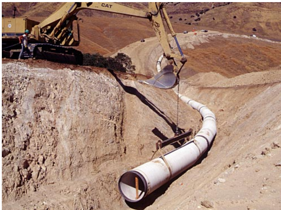
DWR's extension of the Coastal Branch to serve San Luis Obispo and Santa Barbara Counties provides an imported surface water supply that can help reduce overdraft of coastal groundwater basins.

Several decades of over-pumping groundwater have caused seawater intrusion in the aquifers that supply the Salinas Valley with nearly 100 percent of its fresh water. Seawater has intruded almost 6 miles inland into the 180-foot aquifer and two miles inland into the 400-foot deep aquifer. This intrusion has rendered the groundwater too salty for either municipal or agricultural use. Replenishment of groundwater occurs primarily from percolation of surface water from the Salinas River and its tributaries. The construction of Nacimiento and San Antonio Dams in 1957 and 1965, respectively, has increased replenishment but has