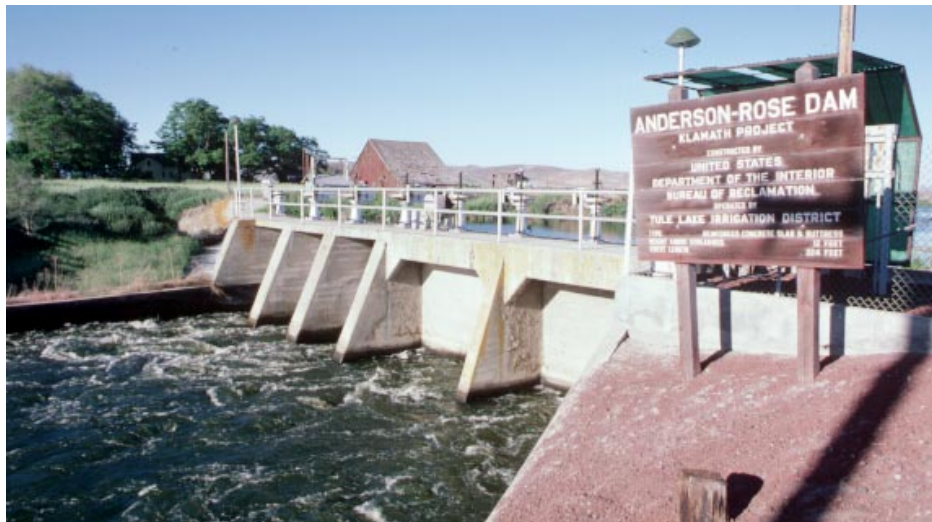
USBR’s Anderson-Rose Dam is located on the Lost River in Oregon, just north of the stateline. This Klamath Project facility diverts water to serve irrigation needs on the bed of the former Tule Lake in California and Oregon.

Exports from the Trinity River to the Sacramento River Basin began in 1963. From 1980 through 1995, Trinity River exports averaged 825 taf annually. In 1981, the Secretary of the Interior increased instream flow requirements in the Trinity River from 120 taf to 287 taf in drought years, and 340 taf in wet years. In 1991, the Secretary of the Interior amended the 1981 decision, directing that at least 340 taf be released into the Trinity River for water years 1992 to 1996, pending completion of a USFWS instream flow study. In 1992, CVPIA mandated that the secretarial decision remain in place until the instream flow study was com-