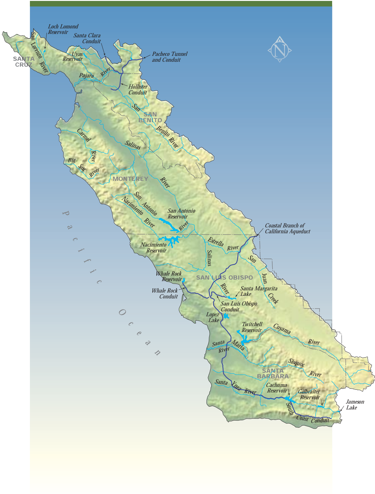
FIGURE 7-4. Central Coast Hydrologic Region