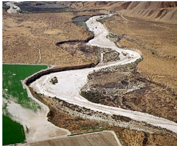
The Cuyama River has its headwaters in northwestern Ventura County and flows onto the Cuyama Valley floor in San Luis Obispo and Santa Barbara Counties. As suggested by this photo, the river's flow is ephemeral. Valley agriculture is supported by groundwater.

Table 7-17 shows a list of options for the region, and the results of an initial screening of the options.