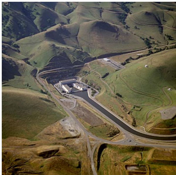
The Department’s A.D. Edmonston Pumping Plant lifts California Aqueduct water 1,926 feet across the Tehachapi Mountains to serve Southern California. The maximum plant capacity is 4,480 cfs.

About 96 percent of San Diego County’s population resides within SDCWA’s service area. SDCWA, a wholesale water agency, purchases imported water from MWDSC and delivers the water to its 23 member agencies (Table 7-26) in the western third of San Diego County through two aqueduct systems. SDCWA’s maximum annual delivery was 647 taf in 1990. Most of San Diego’s in-county water supplies are from local agencies’ surface reservoirs. Twenty-four surface reservoirs are located within its service area, with a combined capacity of approximately 569 taf. Some reservoirs are connected to SDCWA’s aqueduct system and can receive imported water in addition to surface runoff. In 1995, local water sources provided 118 taf, or 23 percent of the water used in SDCWA’s service area. (Since 1980, local surface water supplies have ranged from 33 taf to 174 taf annually.)