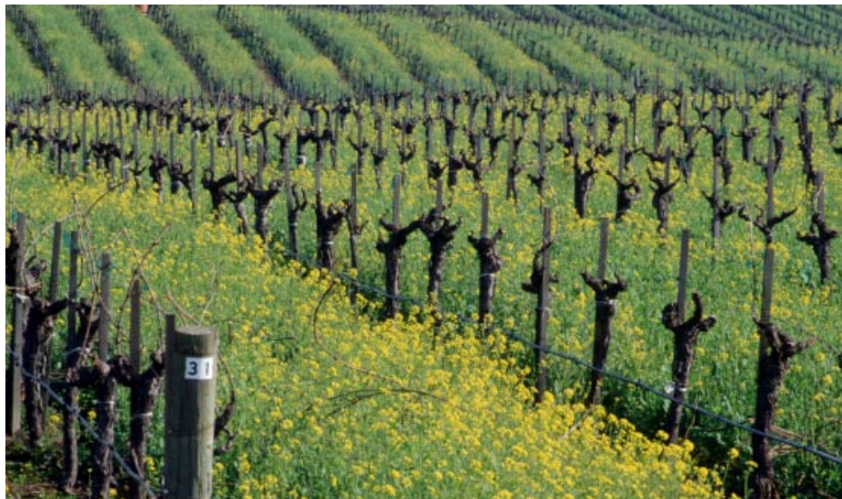
Vineyard acreage in the Napa and Sonoma Valleys is among the State's most expensive agricultural real estate. Grapes—wine grapes, table grapes, and raisin grapes—are one of California's top dollar value crops.