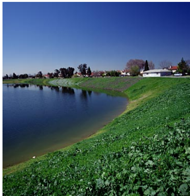
Santa Clara Valley Water District operates an extensive system of groundwater recharge facilities, some of which are incorporated into a regional system of recreational walking/biking trails

County. Deliveries from CCWD go up during droughts as industrial diverters stop diverting with their own Delta water rights (because of water quality constraints) and use CCWD's CVP supplies instead. CCWD's 195 taf/yr CVP contract was recently renegotiated to include operation of Los Vaqueros Reservoir, completed in 1998. Under its new CVP contract CCWD will receive 75 percent of the contract amount, or 85 percent