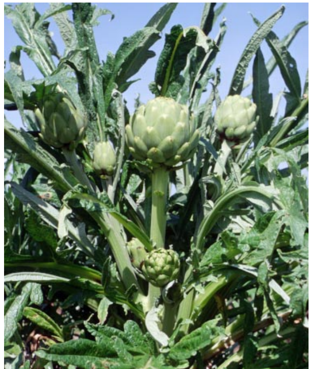
The Pajaro and Salinas Valleys are known for their production of specialty crops. Castroville is sometimes called the artichoke capital of the world.

Major economic activities include tourism, agricultural-related processing, and government and