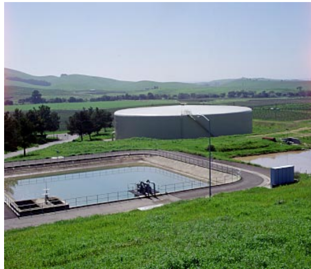
The SWP’s North Bay Aqueduct terminates at the Napa Turnout Reservoir, a 22 af storage tank. Napa County Flood Control and Water Conservation District is the contractor for this water supply.

Table 7-10 lists the major water suppliers in the South Bay and their primary sources of supply. Those areas not served by the listed suppliers get their water from groundwater and from small locally developed surface supplies. Alameda County Water District, Zone