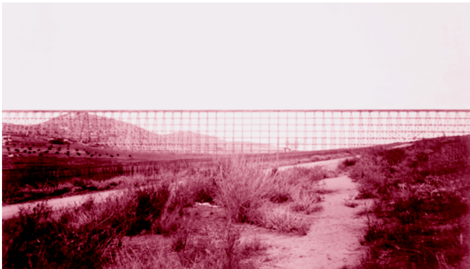
Plans to construct a San Diego emergency storage project reflect the area's vulnerability to natural disasters such as earthquakes. Much of the area's supplies are imported through the Colorado River Aqueduct. This photo shows an early example of local conveyance projects—a wooden trestle carrying a flume across the Sweetwater River.

The Inland Feeder is a new conveyance facility to deliver SWP water made available by enlargement of the East Branch of the California Aqueduct. Upon its completion in 2004, the Inland Feeder will deliver