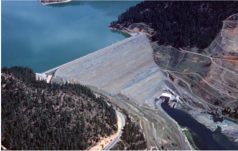
Trinity Dam and Trinity Lake. Releases from the reservoir are reregulated at Lewiston Dam, 7 miles downstream on the Trinity River. At Lewiston, water is either released back to the Trinity River or diverted through the Clear Creek Tunnel into the Sacramento River Basin.