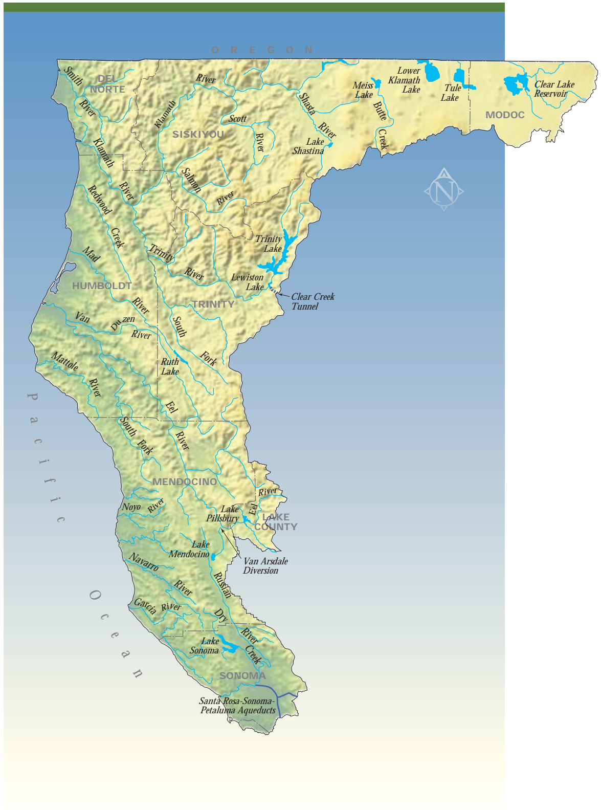
FIGURE 7-2 North Coast Hydrologic Region