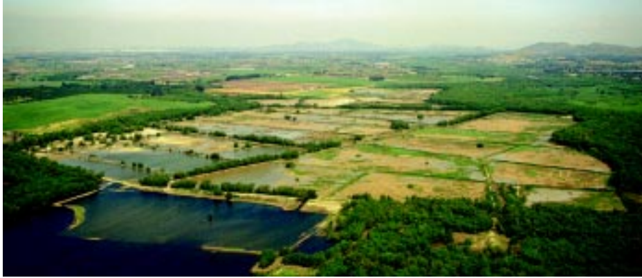
An aerial view of the constructed wetlands behind Prado Dam.