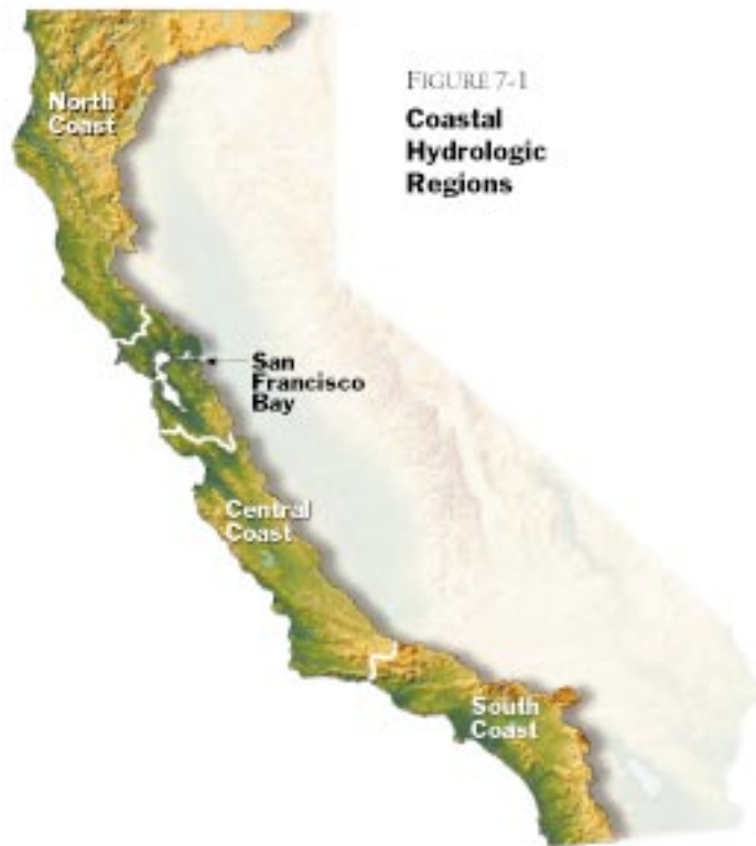
FIGURE 7-1 Coastal Hydrologic Regions

T his chapter covers the coastal hydrologic regions of the State: the North Coast, San Francisco Bay, Central Coast, and South Coast (Figure 7-1). These four regions make up 29 percent of the State's land area and were home to 78 percent of the State's population in 1995.