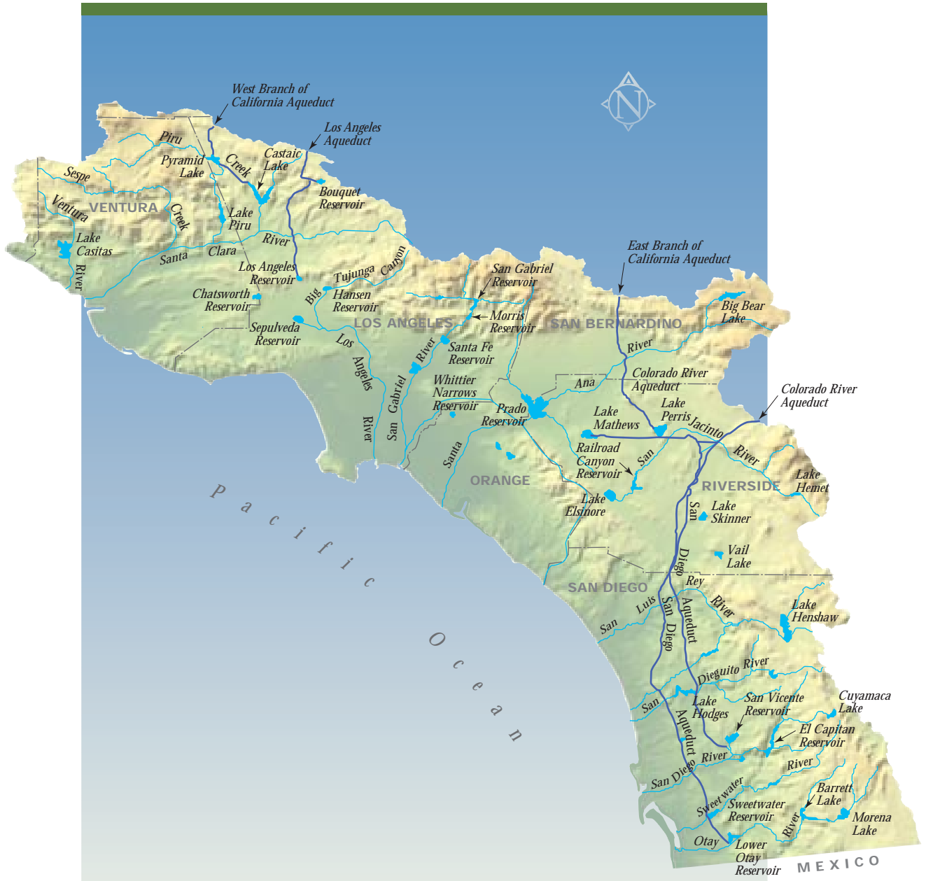
FIGURE 7-5 South Coast Hydrologic Region